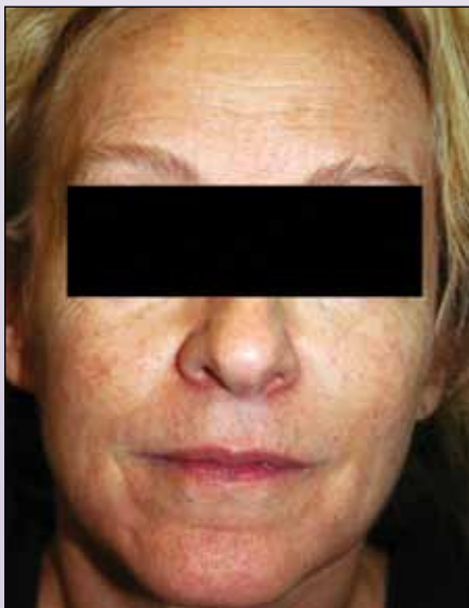
After six Accent XL treatments